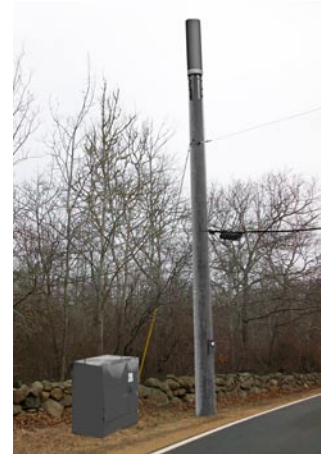
The above images show how the equipment will appear—and the minimal impact it will have on Island aesthetics.