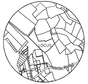
LOCUST MAP Scale: 1" = 750'